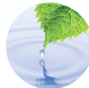
Healthy for you, your family and the environment.