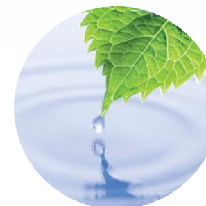
Healthy for you, your family and the environment.