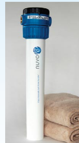
Amazingly small—perfect for apartments, condos and other limited spaces.